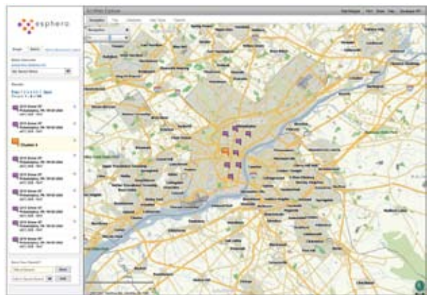
Sample Esphero web service screen.

We provide a service bureau offering whereby the client sends Avencia a database , we process it and return it with latitude/longitude coordinates.